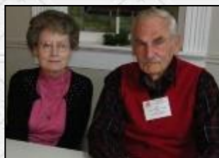
We had about 40 people attend the December Camp Meeting. Here are a few pictures of those attending.